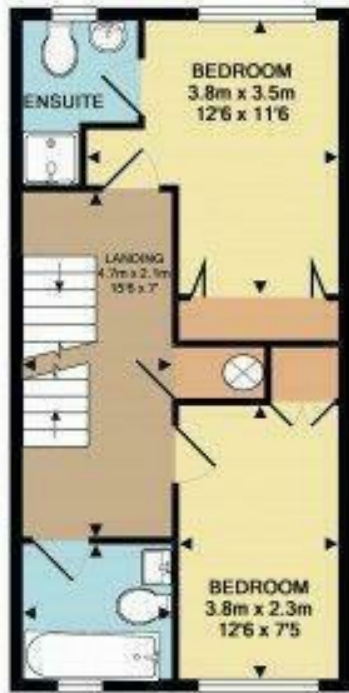
1ST FLOOR: APPROX. FLOOR AREA 39.7 SQ.M. (427 SQ.FT.)